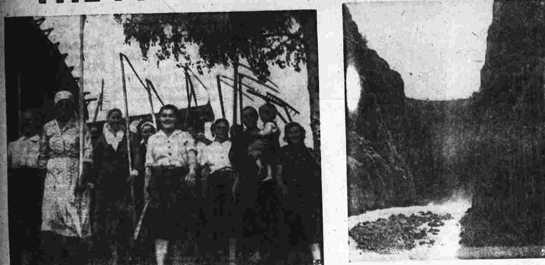
BACK TO THE LAND —Carrying sheaves and rakes, these collective farm women set out to do a day's work in the fields of Russia. This is a British official photograph.