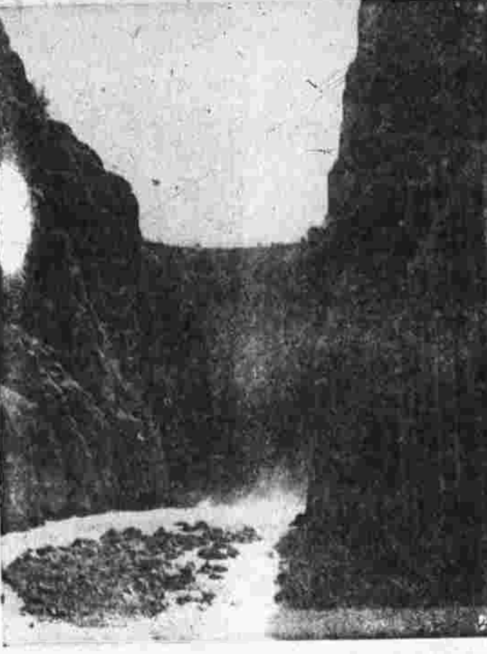
SHOSHONE DAM —In the Shoshone canyon, eight miles above Cody in northwestern Wyoming, the Shoshone dam and power plant which backs up water of the Shoshone river for use in reclaiming arid lands and generates electrical power.