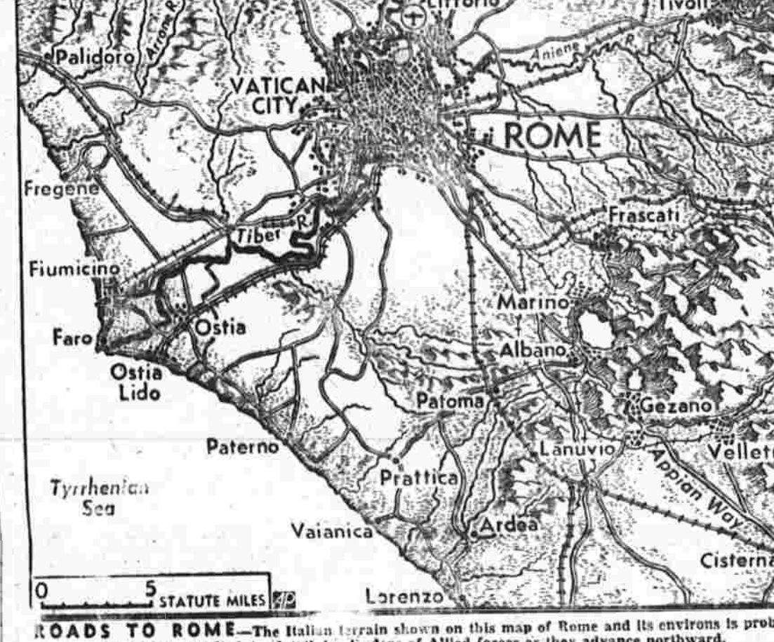
ROADS TO ROME —The Italian terrain shown on this map of Rome and its environs is probably being studied in detail by leaders of Allied forces as they advance northward.

Herold MacMillan, it is understood, has stressed the military considerations in delivering Britain's protest against the French action which French forces were reported to have planned in the high Lebanese officials.